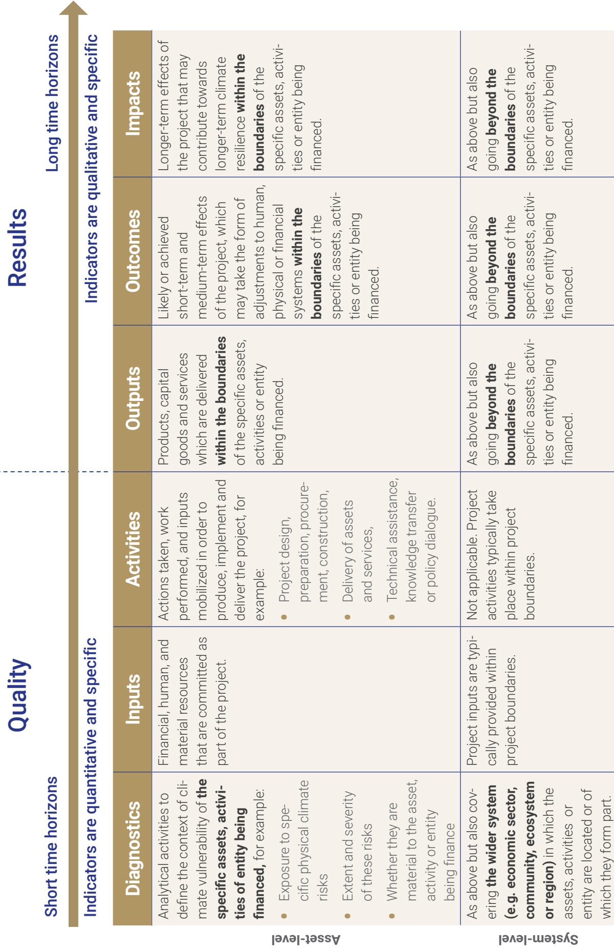
FIGURE 2 Logic model and results chain